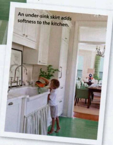
An under-sink skirt adds softness to the kitchen.